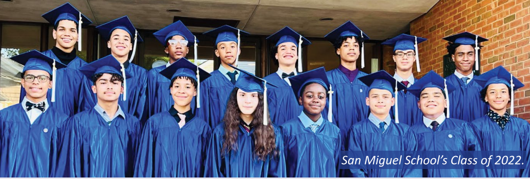
San Miguel School's Class of 2022.