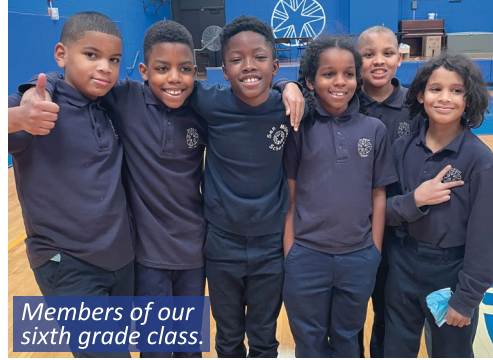
Members of our sixth grade class.

The brain of a middle schooler changes more rapidly during these years than at any other stage, except for their first five years of life. During middle school, students are gaining social emotional skills and beginning to develop empathy maturity. It is a time when young people are particularly impressionable to both positive and negative influences as they are establishing more mature peer relationships. Intervention by adults during this time can have very positive effects on the student’s decision-making and sense of self. “This time is often misunderstood and underestimated