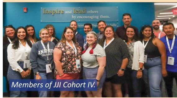
Members of JJI Cohort IV.

he joined the new cohort of the John Johnston Institute (JJI). He writes, "This summer, I had the privilege to enroll in Cohort IV of the John Johnston Institute. In early July, we were able to meet for the first time together as a group at Manhattan College. There were Lasallians who gathered from Rhode Island, New York, Pennsylvania, Maryland, Washington D.C. and Illinois. During our first gathering, we focused on the history and humble beginnings of St. John Baptist de La Salle. We were able to have many discussions and reflections regarding how his mission is still alive and well at our respective ministries. The unique perspectives that each and every individual provided allowed us to grow together as a cohort. I gained a great amount of knowledge and appreciation for our history and how our Lasallian leaders are constantly evolving and adjusting in accordance with our modern world. I was inspired by the presence of such strong-willed individuals who were doing such great work in their Lasallian communities. I continue to be humbled by the support of my peers and their affirmation of the great work I try to continue to do here at San Miguel."